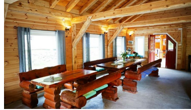
Borgund Hyttesenter og Camping - restaurant

There is free WIFI and TV in the restaurant.